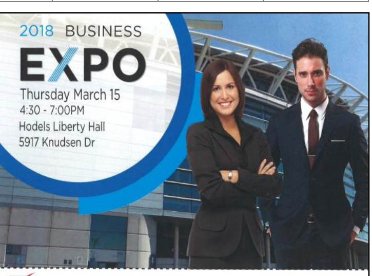
Yes! Count me in! You'll see my booth at the 2018 Expo!

THE CHAMBER WOULD LIKE TO WISH EVERYONE A SAFE AND WONDERFUL HOLIDAY. DUE TO THE OVERWHELMING NUMBER OF EVENTS IN DECEMBER AND LOW PARTICIPA-TION RATE, THE CHAMBER HAS DECIDED TO CANCEL THE ELF OLYMPICS FOR 2017. WE WOULD LIKE TO THANK TUHS CTEC AND TUHS JAZZ BAND FOR THEIR WILLINGNESS TO ADD ONE MORE THING TO THE HOLIDAY CALENDAR. WE HOPE YOU UNDERSTAND AND THE CHAMBER HOPES TO BE ABLE TO CREATE THE FUN, FAMILY EVENT NEXT YEAR.