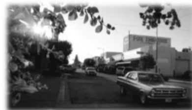
Center Street Cruisin'