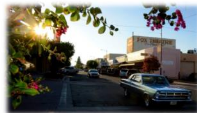
Center Street Cruisin'